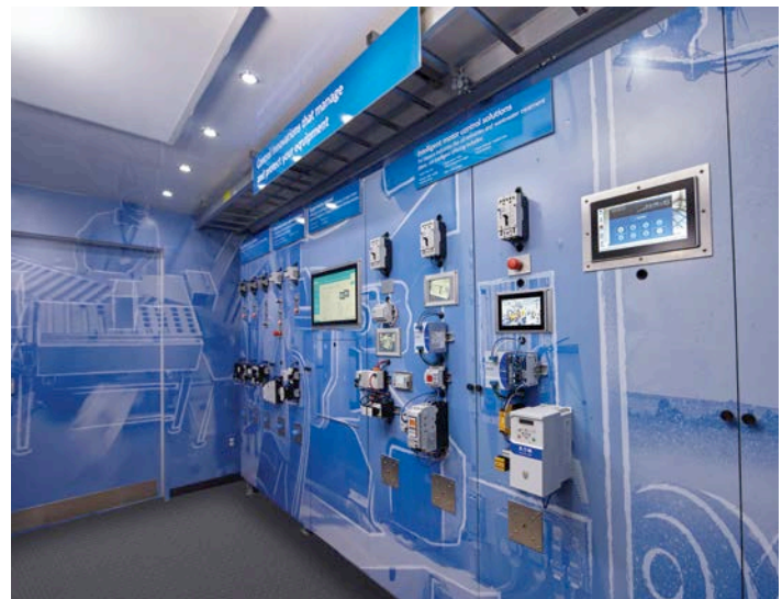
Full range of motor control capabilities, from basic to advanced to intelligent