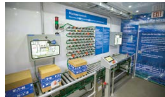
Pumping, HVAC/R and conveyor IoT experience demonstrations