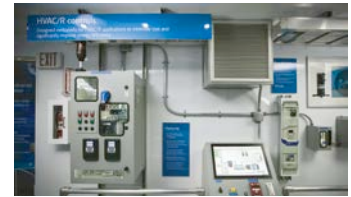
HVAC/R Rooftop air handler demo