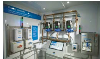
Pumping Booster pump system demo