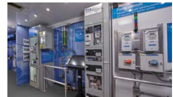
Process industry MCC and 18-pulse variable frequency drive (VFD) demonstrations